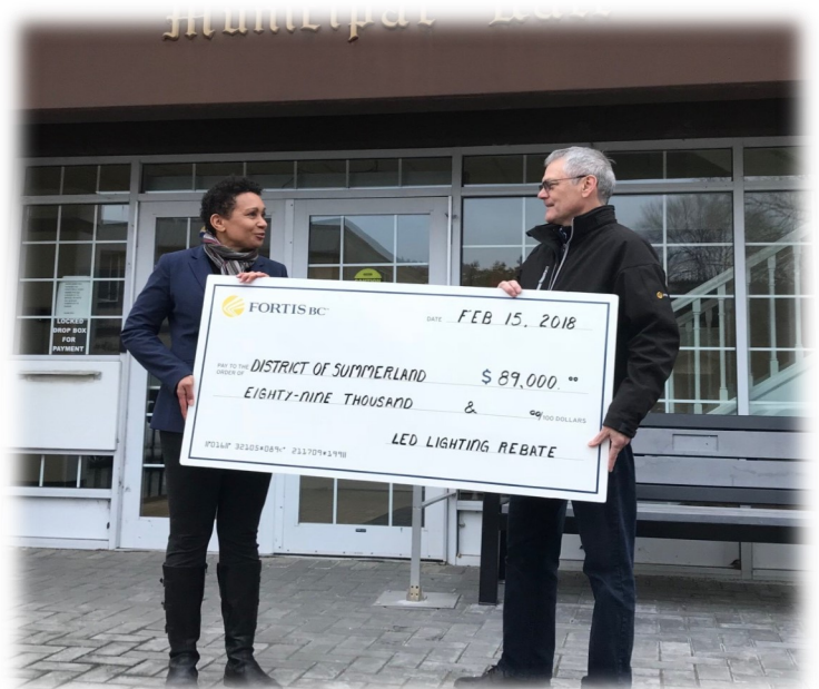
Above: Mayor Boot receives a cheque from FortisBC

After deliberations with Council, the Skatepark Committee and staff, it was decided that for safety reasons, the skatepark is to remain closed until fencing, landscaping, signage and other components have been completed. The public is asked to please stay off the site until it is finished and ready to go. The skatepark will be officially opened in the spring for all to enjoy.