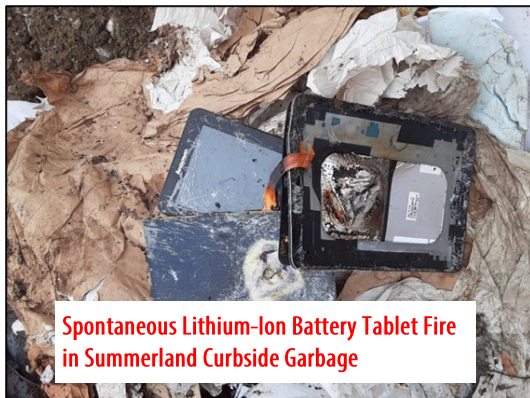
Spontaneous Lithium-Ion Battery Tablet Fire in Summerland Curbside Garbage

Across North America, the industry saw a 26 percent increase in the number of fires in waste and recycling facilities in 2018, with 371 unique incidents reported between February 2018 and January 2019. The waste industry also reported three deaths and 13 injuries.