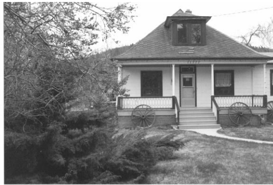
R.B. Angus's orchard home. Co-founder of the Canadian Pacific Railway, National President of Bank of Montreal