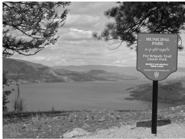
Okanagan Fur Brigade Trail Linear Park One of two parks created for