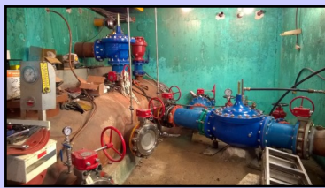
PRV10 Isolation Valve and Line