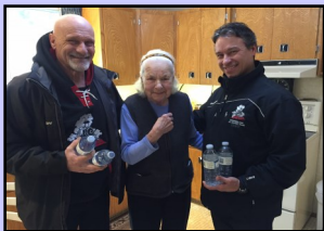
Summerland Steam Helping Out